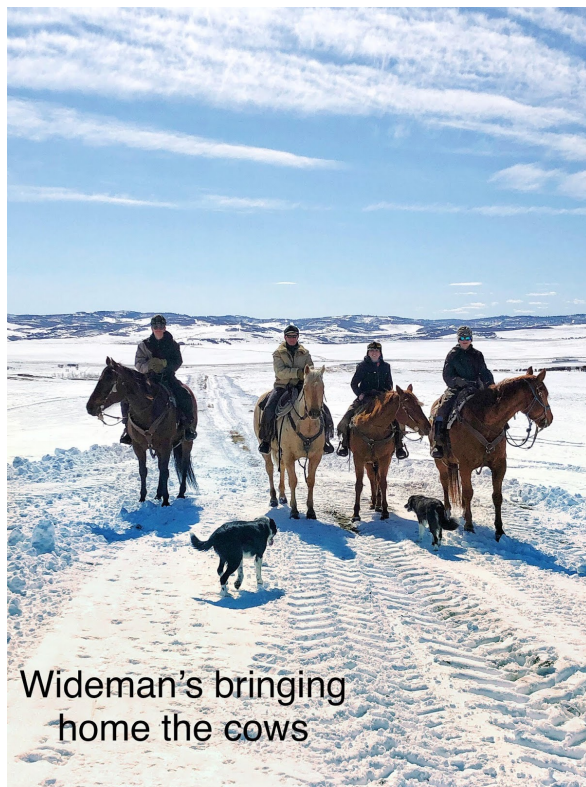
Wideman's bringing home the cows