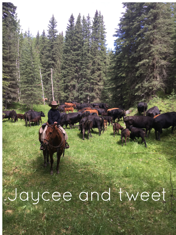
Jaycee and tweet