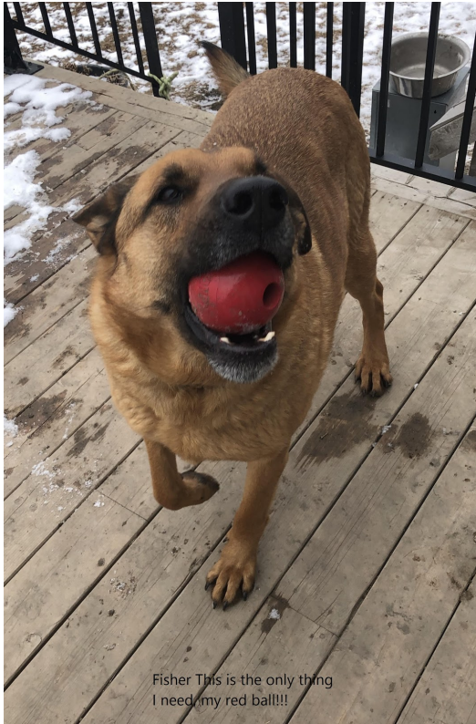
Fisher This is the only thing I need, my red ball!!!