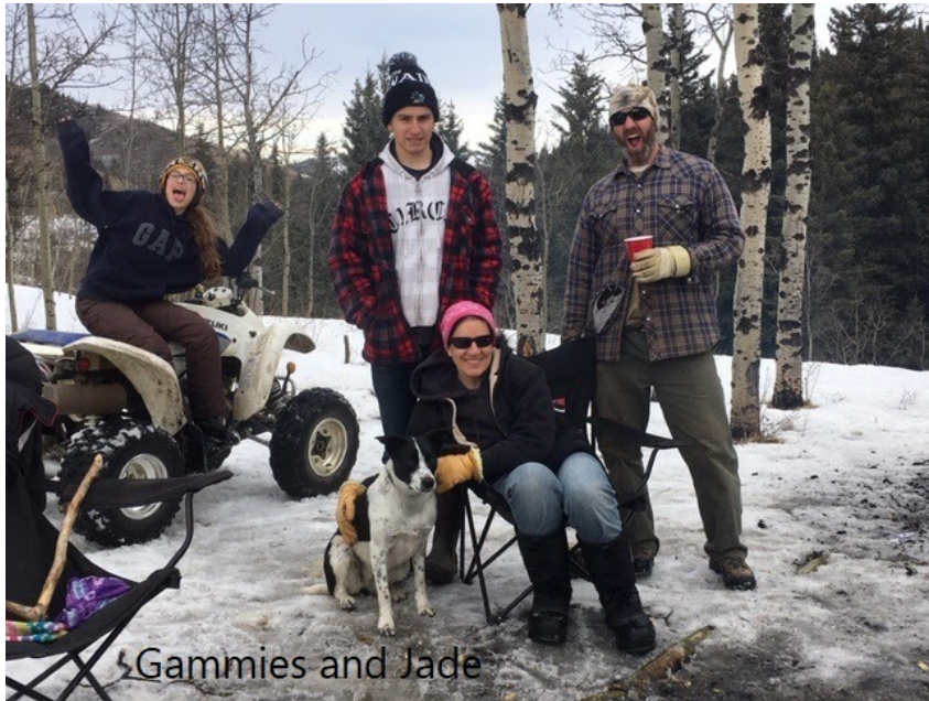
Gammies and Jade